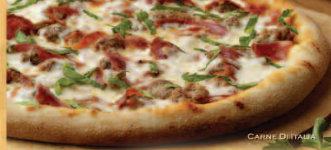
CARNE DI ITALIA