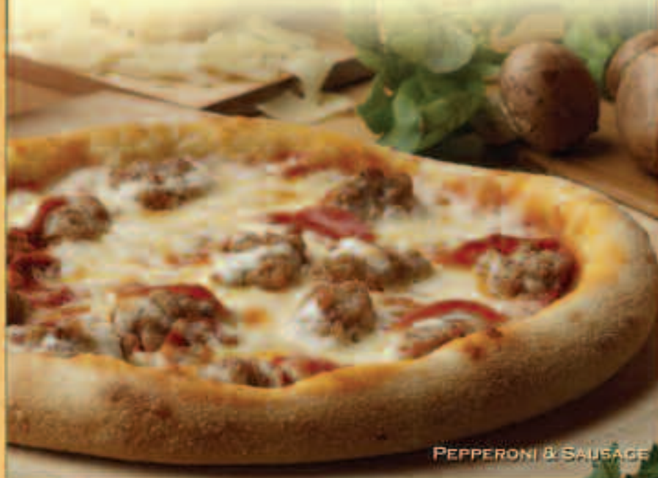
PEPPERONI & SAUSAGE